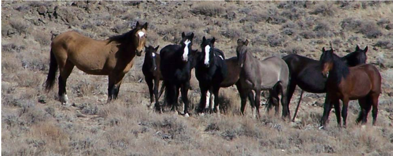
Wild horses living free in Nevada's Calico Mountains Complex prior to the December 28, 2009 - February 4, 2010 BLM roundup.

A Report by: The American Wild Horse Preservation Campaign (AWHPC) www.wildhorsepreservation.org April 15, 2010